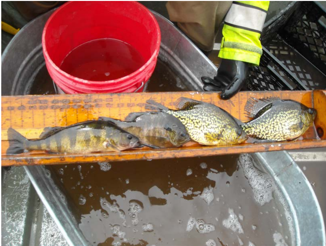
Four legal size panfish (From left to right: yellow perch \geq 9'' , bluegill \geq 7'' , and two black crappies \geq 9'' )