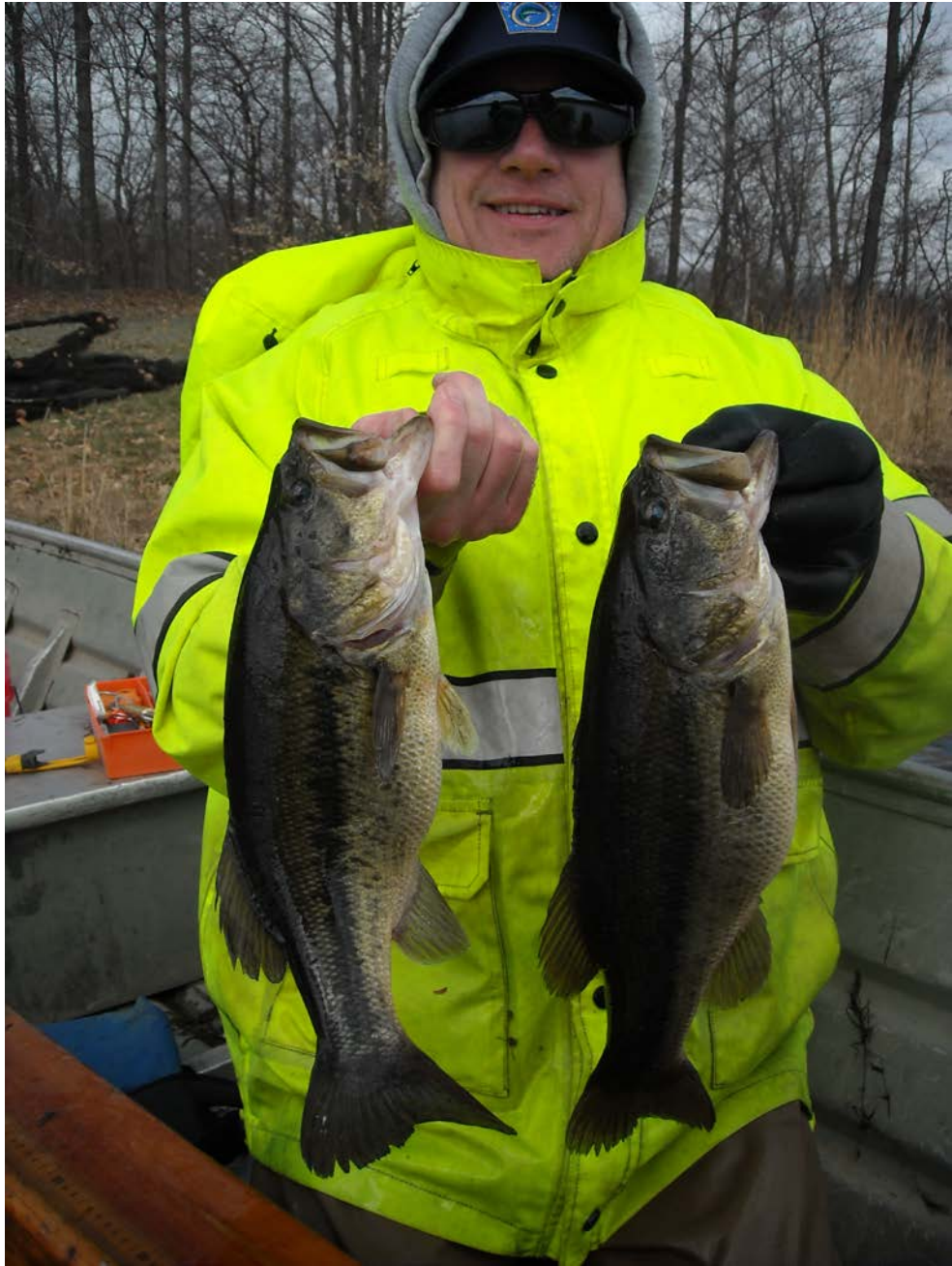
Two legal size largemouth bass