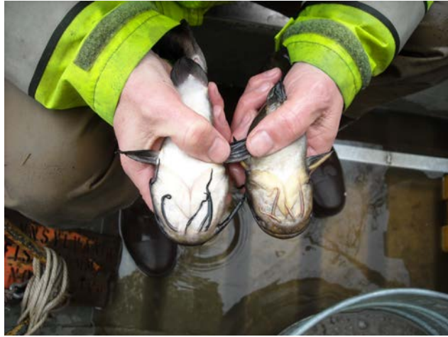
Chin barbels on brown bullhead (left) and yellow bullhead (right)