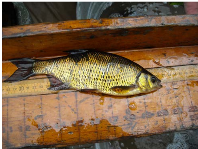
Golden shiner (adult)