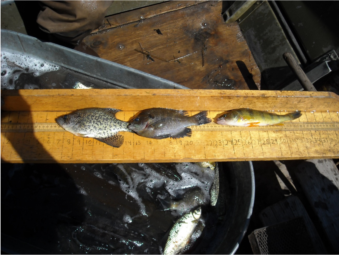
Typical panfish (Black Crappie, Bluegill and Yellow Perch) from Hills Creek Lake.