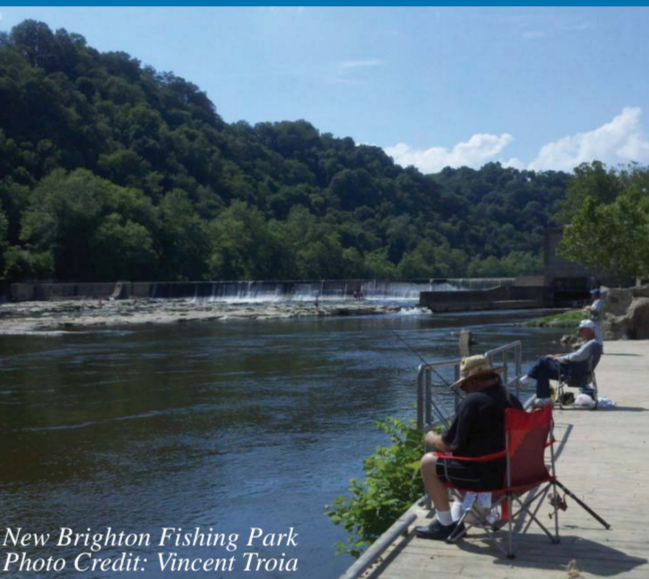
New Brighton Fishing Park

The Beaver River, also known as Big Beaver River and Beaver Creek, is a tributary of the Ohio River in western Pennsylvania. The Beaver River Watershed's southern end, approaching the Beaver's confluence with the Ohio River at Bridgewater and Rochester, Pa is home to a wide range of natural resources; including steep slopes, biological diversity zones, and riparian areas. Anglers will find a variety of fish including channel catfish, largemouth bass, muskie, northern pike, sauger, saugeye, smallmouth bass, walleye and yellow perch. The flat waters of the non-wake Beaver River is exceptional for paddleboarding and kayaking.