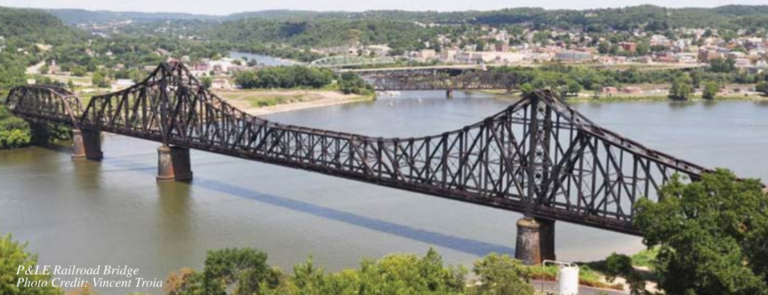
P&LE Railroad Bridge

Developed by the Ohio River Trail Council